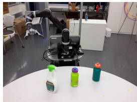
(b) SegBot with mounted Kinova Mico arm.