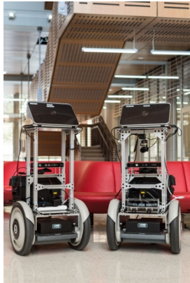
(a) Two SegBots from the Building-Wide Intelligence Project at UT Austin.